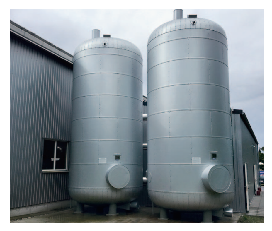
The two buffer storage tanks in Breklum have a volume of 44 cubic meters each.

An interesting project has also been realized in Hamburg. The former air-raid shelter and flak bunker in the Wilhelmsburg district was converted into an "energy bunker" whose south facade is covered by a photovoltaic system. A solar thermal system from Ritter XL Solar, consisting of 315 vacuum tube collectors, extends over the entire roof. The rows of collectors are inclined at only 15° in order to gain as much heat as