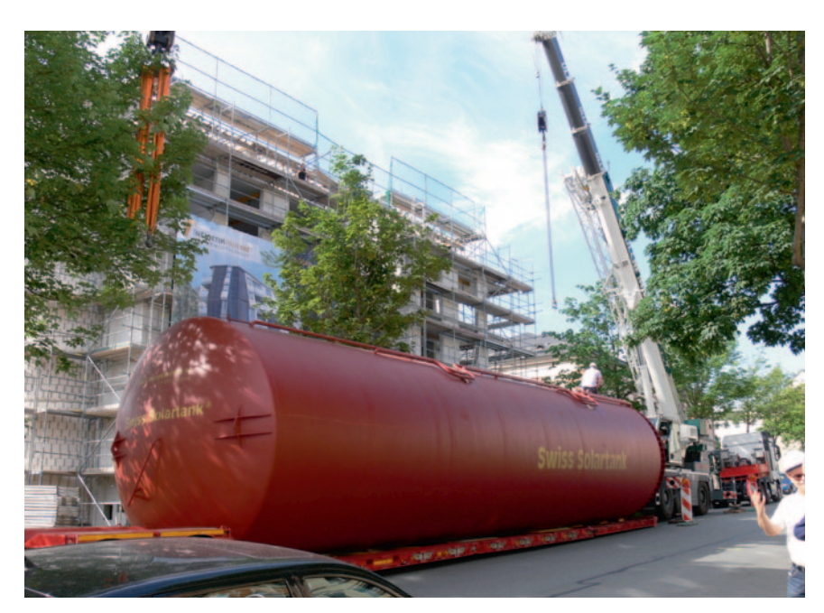
The core component of the building's heating system is a 72 m<sup>3</sup> steel tank, incorporated into the base build in October 2020. With a diameter of 2.3 m and a height of 17.8 m, it extends to all floors of the house.