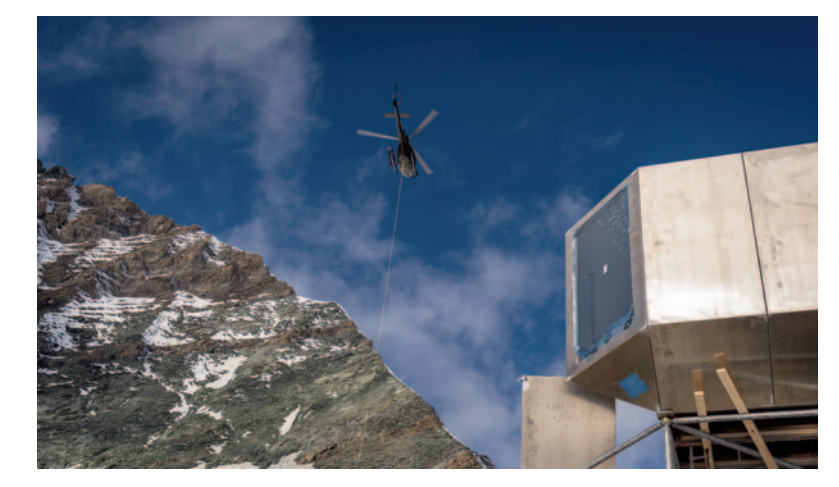
Helicopters flew all the prefabricated hut components to the construction site including the module with the integrated solar air collector, which can be seen at the front in the picture above.

Mountain air does good. Solar air collectors can use it to keep mountain huts dry. This also works on Austria's highest alpine emergency shelter, the Glockner bivouac.