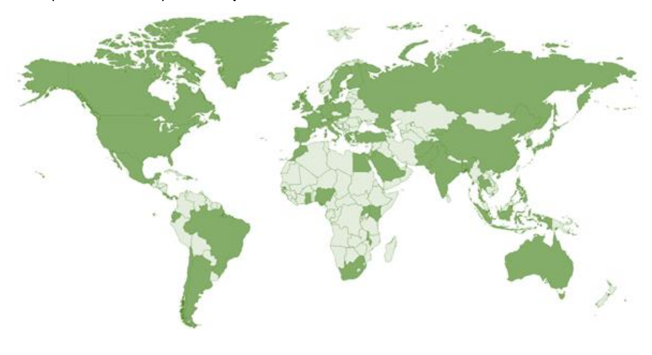
Figure A6.1: Geographic coverage of respondents by country of focus . Dark green indicates at least one respondent. Full responses only.